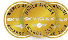
Best Airline in Africa for 3 years in a Row