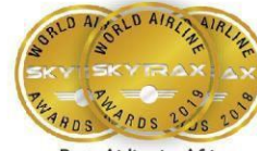
Best Airline in Africa for 3 years in a Row