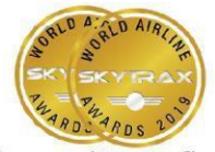
Best Business and Economy Class in Africa for 2 years in a Row