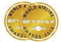
Best Business and Economy Class in Africa for 2 years in a Row