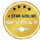
4 star Airline